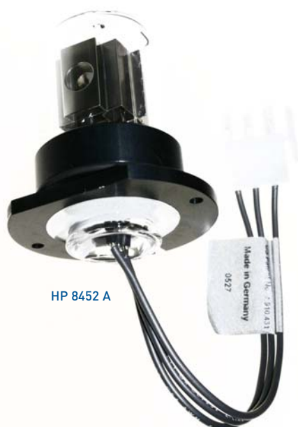
HP 8452 A